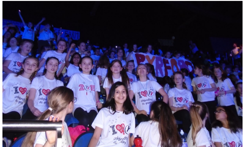
Pyrford pupils had an amazing time singing in the Young Voices Choir at the O2 on Wednesday evening.